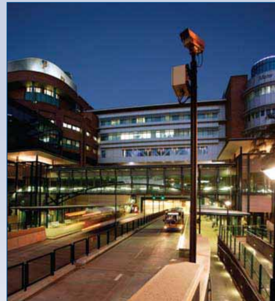
Mater Hill busway station integrated with the Mater Hospital.

Queensland Transport will investigate similar design principles in the Springwood town centre by working closely with the Logan City Council, State Government agencies and local communities to identify development opportunities around the busway.